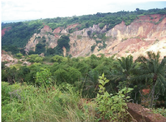
FIGURE 2: A gullied farmland in southeastern Nigeria, after Igwe [39].

In a separate study, Mbagwu [36] reported that the topsoils outyielded the subsoils by a range of 18–40% on two Alfisols, two Ultisols, and one Inceptisol in southern Nigeria.