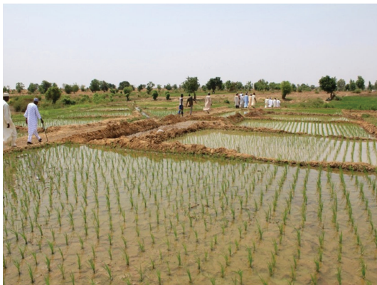
FIGURE 4: A newly developed sawah field located in an inland valley in Jega, Kebbi State of Nigeria.

and floodplains should be cultivated more intensively [49]. However, the existing research concept to improve natural resource management in SSA may not bring about the desired results among the lowland rice farmers, unless there is a clearly defined research concept to improve soil and water conditions of the lowlands. Application of the three core Green Revolution technologies (high-yielding varieties, inorganic fertilizers, and irrigation facilities) outside the sawah system can even degrade the environment, such as that emanating from inefficient fertilizer use under situations of poor water management prevailing in non- sawah rice fields [48]. At the moment, the sawah ecotechnology appears to bring to an end the search for a farming system that addresses this issue in the region. So, for the advocacy for increased fertilizer use in Africa [55] to suitably apply to lowlands, sawah systems must first be put in place. The farmers themselves now know that the high-yielding varieties respond well to fertilizers only when they are grown