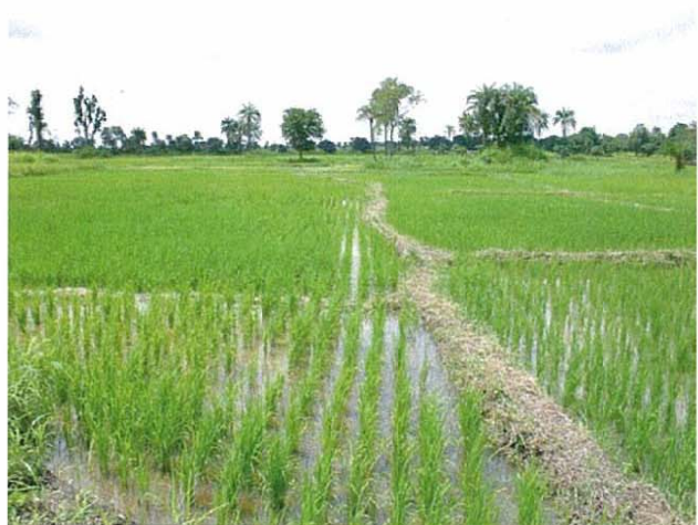
Figure 2. Recommended sawah practice.