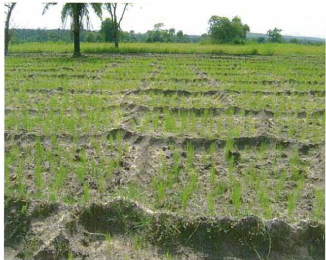
Figure 1. Rudimentary/traditional sawah practice.

Social scientists investigating farmers' adoption behaviour have accumulated considerable evidence showing that demographic variables, technology characteristics, information sources, knowledge, awareness, attitude and group influence affect adoption behaviour. This is predicated on the importance of farmers' adoption of new agricultural technology which has long been of interest to agricultural extensionists and economists.